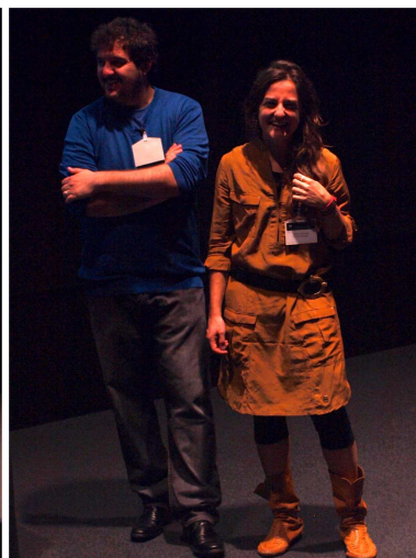
Fig. 3. Left: Local Group, Local Cosmology. Right: the organizers of the Symposium.