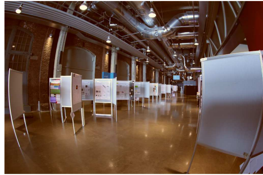
Fig. 1. Left: Logomo Sali. Right: poster hall.