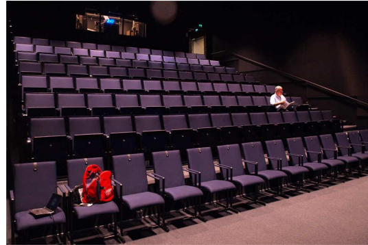
Fig. 2. Left: lunch breaks. Right: the conference room.