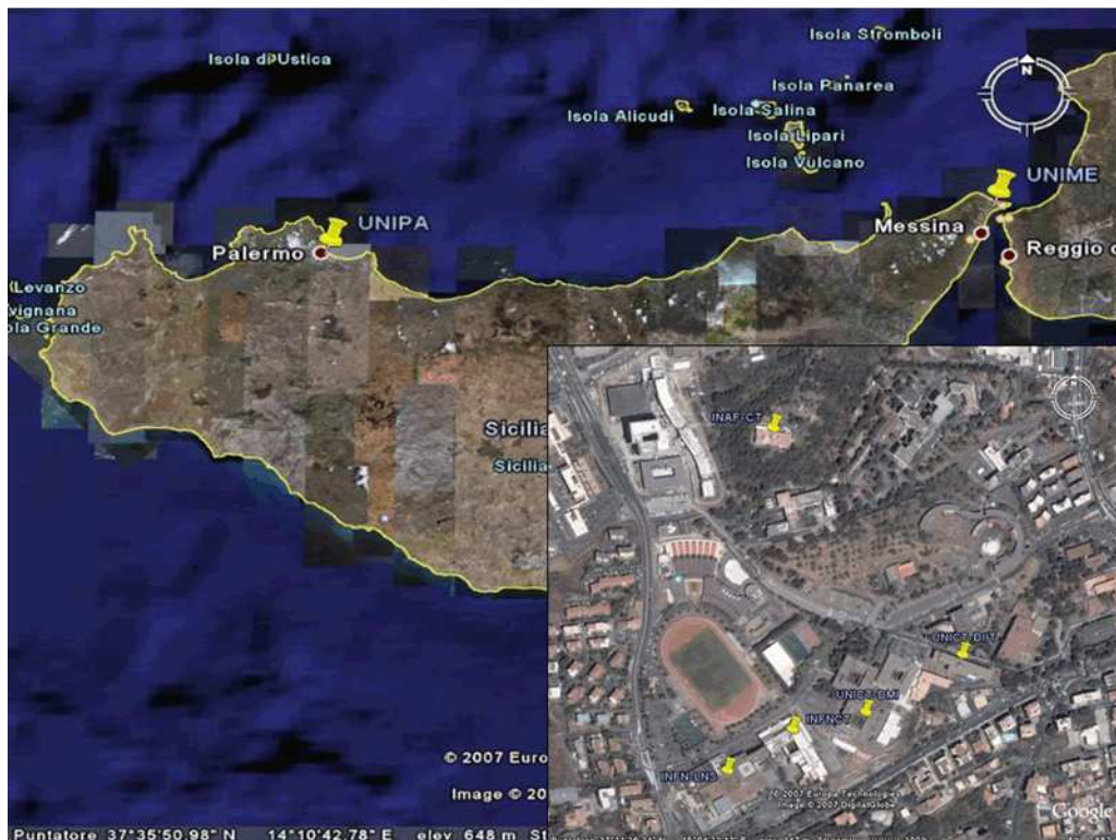
Fig. 2. The PI2S2 infrastructure in Sicily

about 2000 CPU cores and more than 200 TB of disk storage space are currently available on the Sicilian e- Infrastructure.