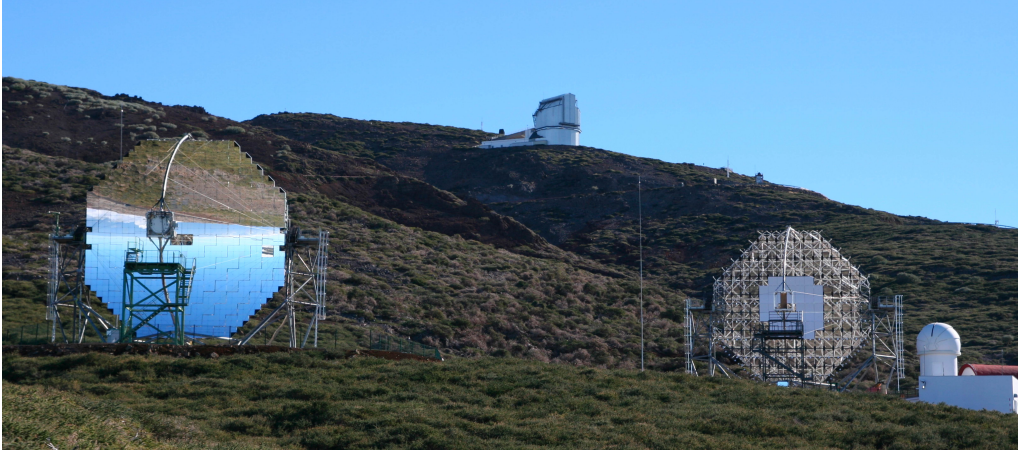
Fig. 1. MAGIC and MAGIC 2 (under construction) in La Palma on Dec 2007. On the background the Italian Telescopio Nazionale Galileo , a 3.5 m optical telescope operated by INAF.

counterpart. The major scientific objective of \gamma -ray astronomy is the understanding of the production, acceleration, transport and reaction mechanisms of VHE particles in astronomical objects. This is tightly linked to the search for sources of the cosmic rays connecting astrophysics with particle physics, so the physics program of the (e.g.) MAGIC telescope includes topics, both of fundamental physics and astrophysics. In the next 10 years, GLAST and (for less time) AGILE satellites will observe the Universe in the MeV-GeV band providing a unique opportunity for Cherenkov Telescopes to observe the same sources and to cross-calibrate instruments in the GeV band. In such a scenario the development of a next generation of Cherenkov Telescopes is mandatory in order to achieve 10 times the sensitivity of current instruments, an increased flexibility and an increased coverage from some 10 GeV to some 100 TeV.