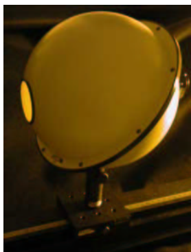
Fig. 4. Variable Low Light Level Calibration Standard

nance is not expected to have an outstanding spatial uniformity. So, for calibrating and testing photometers and radiometers to very low light levels, we set up a specific Variable Low-Light-Level Calibration Standard. It consists of an 8-inch diameter Integrating Sphere with the entrance port illuminated by a Spectral Irradiance Standard source or some other lamps (HPS, HQL, QTH, Illuminant A). Our coated sphere with two in-lined ports and an in-lined baffle is specifically made to obtain the best radiance and luminance uniformity over the 2-inch exit port. The radiance/luminance can be varied over a factor of \approx 10^{10} . In particular, a fixed aperture wheel provide a calibrated set of relative luminances to a factor 1:376 and a variable aperture stop with some optical devices allows to continuously regulate the starting luminance to a factor 1:45. A shutter allows to measure the background light.