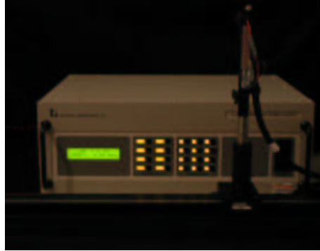
Fig. 2. The Radiometric Power Supply and the Optical Rail with the standard lamp