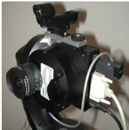
Fig. 1. WASBAM imaging camera